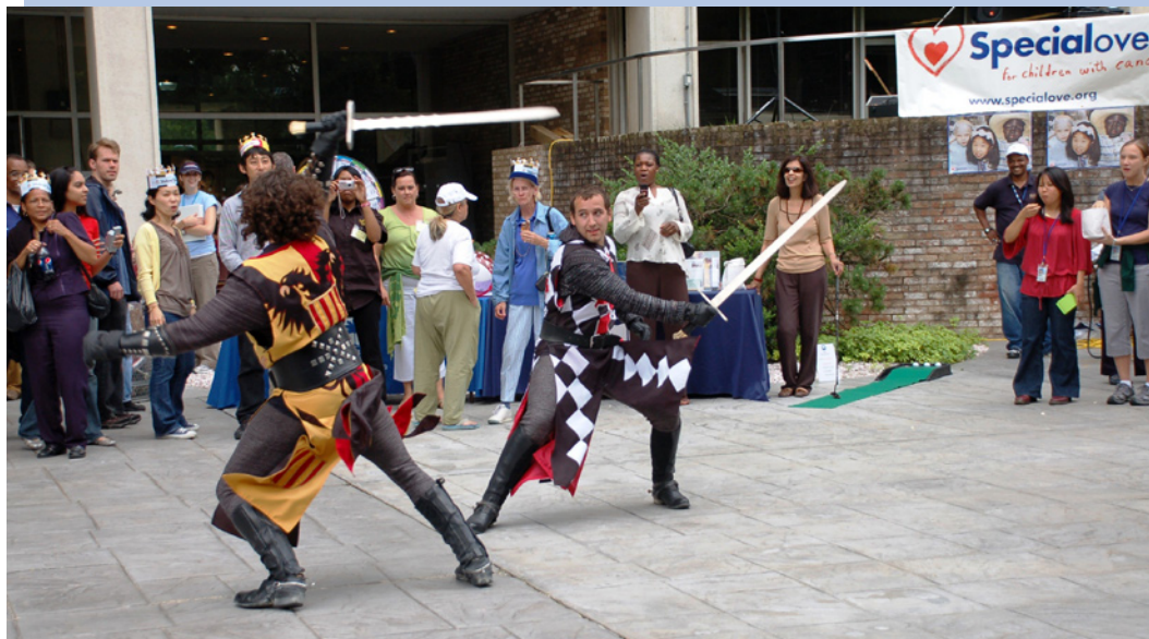
No Knights, So Long. Knights of Medieval Times duel before a live audience. No blood was shed and no swordsman was hurt in the making of this demonstration.

"This year was a huge success," said one of several R&W event organizers. "Thanks to everyone who came out and supported the event. We plan to make next year even bigger and better."