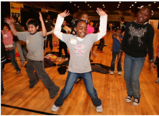
At a National P.E.P. (Play More, Eat Right and Push Away the Screen) Rally, more than 200 children participate in fitness activities offered through NIH's We Can! program.