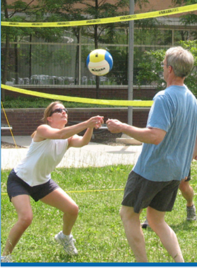
ABOVE • Volleyball on the plaza between Bldgs. 33 and 31 was one aspect of 'Get Beach Ready.' See story on p. 9.