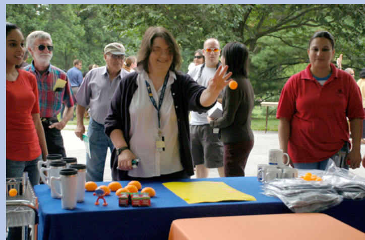
Above, attendees play carnival games to benefit Camp Fantastic. At left, a celebrity sighting? A waxen JLo oversees activities at the BBQ. Below, the well-attended event sold out about midway through the lunch hours. Organizers deemed it a rousing success.