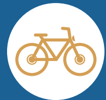
BIKE SUBSIDY PROGRAM