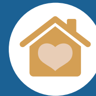
CHILD & ADULT DEPENDENT CARE