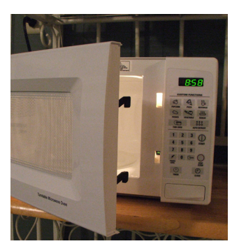
Check your container before putting leftovers in the microwave.

Popping a dish into the microwave and pressing start is an easy way to heat leftovers or a meal from the deli. But could microwaving food in a plastic container increase your risk of cancer?